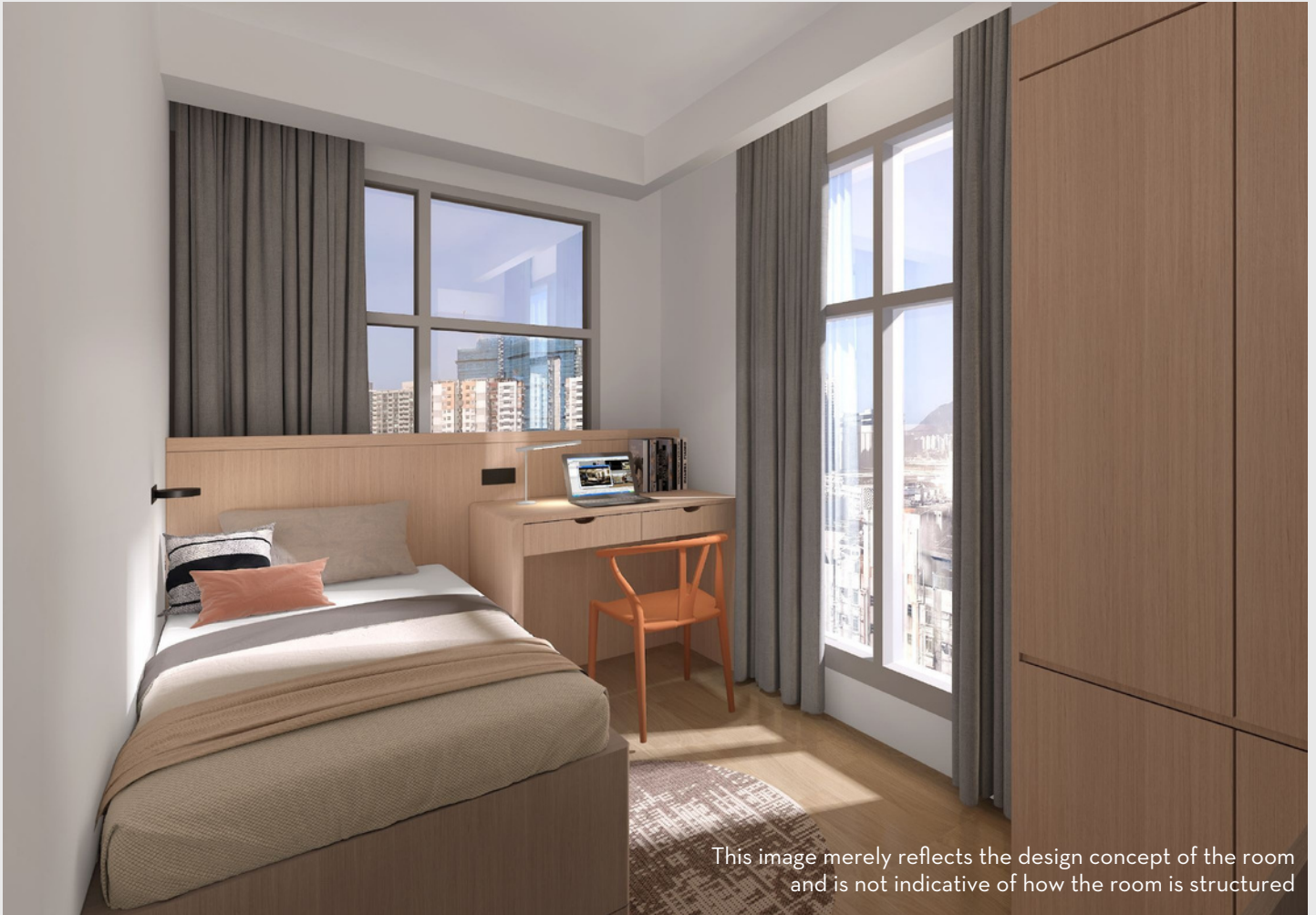
This image merely reflects the design concept of the room and is not indicative of how the room is structured